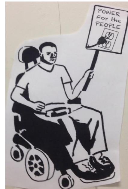
Power for the People