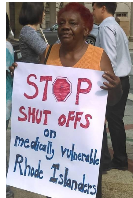
In front of Superior Court, before filing the lawsuit