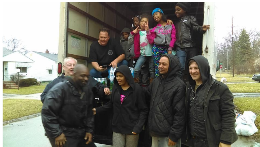
In front of the truck we drove to Flint, MI, delivering water & solidarity from RI