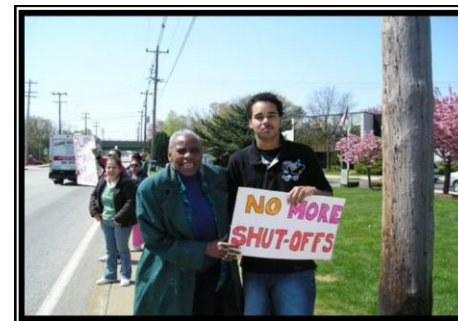
Outside the Division of Public Utilities in Warwick, RI

Building a just society requires strength in numbers. A strong membership is critical for us to win battles at the statehouse and with public agencies. Your membership is one way to affirm your connection to other members and to show that you are committed to direct action for social justice. Our power depends on members who are willing to step up and attend actions, attend meetings, make phone calls, advocate for each other, and be a visible reminder that social justice is crucial to a sustainable society. Help us continue the fight to make Rhode Island a better home for us all!