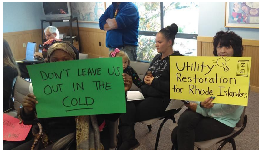
Inside a hearing for GWC's proposed Restoration Regulation, PUC, Warwick