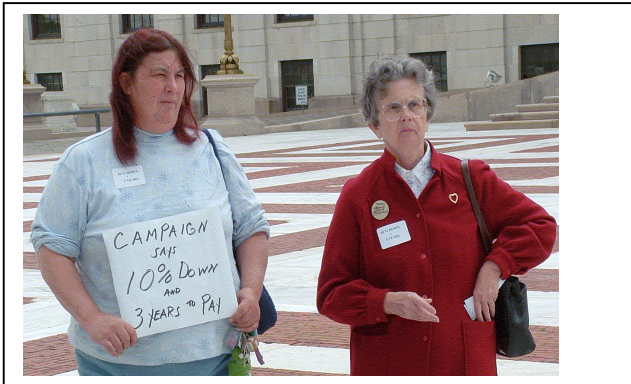
What happened with P.I.P.P.?

After a 5-year effort, RI passed the "Comprehensive Energy Conservation, Efficiency & Affordability Act of 2006," which contains two provisions that benefit low-income households. By November 2007, utility companies must implement new plans to: 1) restore utility shut-offs that caps the down-payment at 25% (instead of 25% to 50+%), forgives 37.25% of past due amounts and has a 36-month payment plan; and 2) discount electric, gas and heating oil rates up to 25% off on standard usage amounts. One provision has the potential to benefit all consumers: one seat on the new, governor-appointed Energy Efficiency and Resources Management Council shall "give due consideration" to low-income consumer interests. While there is no guarantee that a low-income consumer, or low-income advocate, will be appointed, at least Rhode